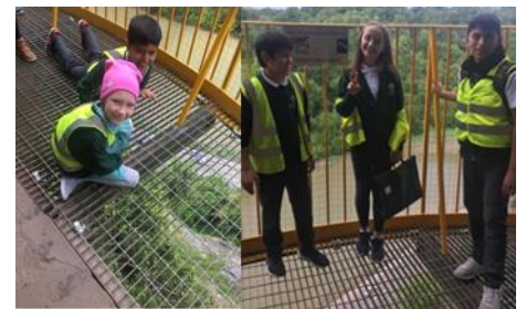
Then we walked over the Suspension Bridge and saw this amazing view.